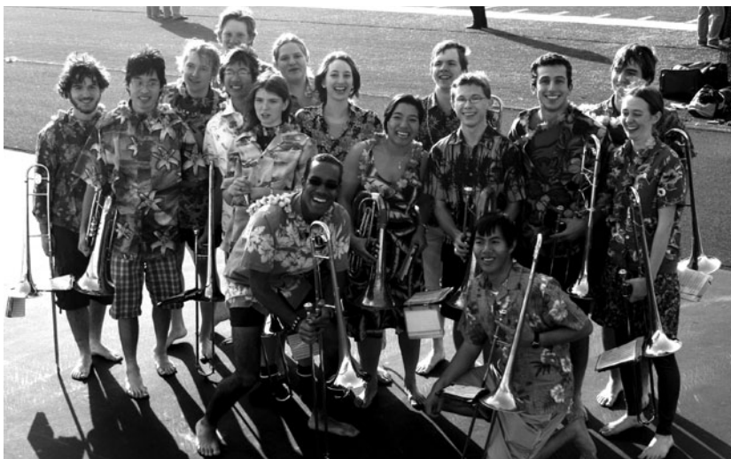
The Trombones in Hawaiian attire at the last home football game of the season.