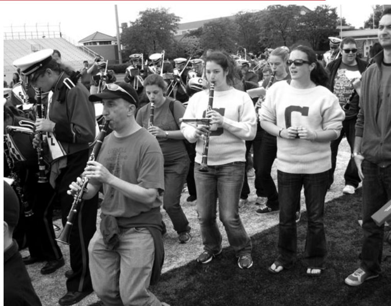
Clarinet alumni at the Homecoming Tail Gate