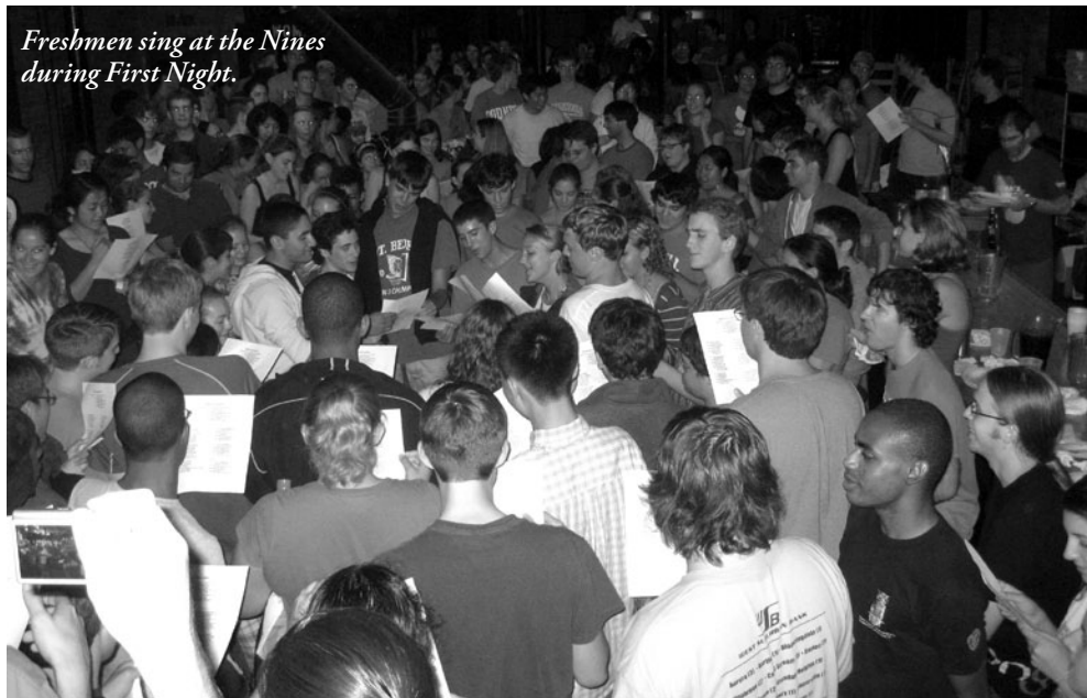
Freshmen sing at the Nines during First Night.