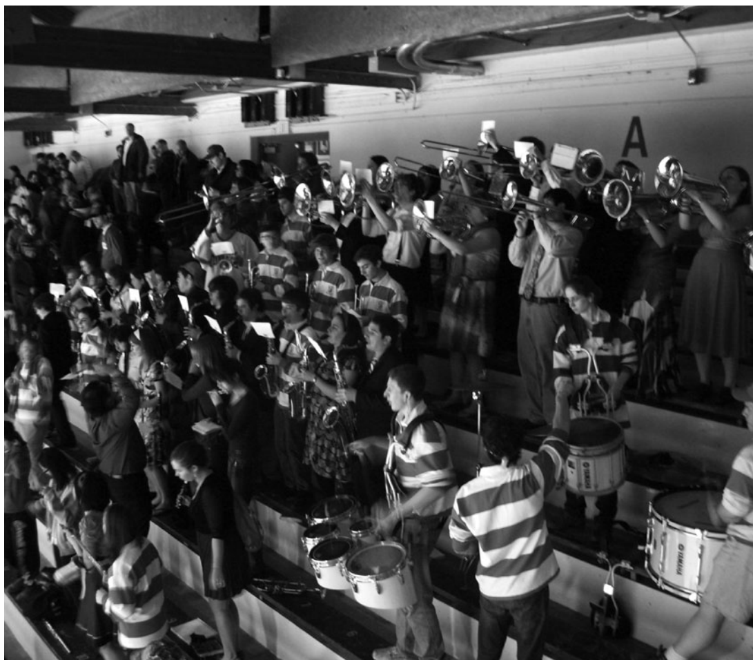
The pep band, performed at the NCAA women's quarterfinal ice hockey game at Lynah Rink.