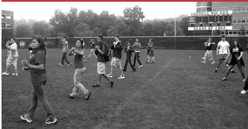
Band members practice marching at band camp.

H oly Cow! It's still difficult to believe what an intense semester this past spring was. The band performed at seven NCAA tournament games in men's hockey, basketball, and lacrosse as well as nine conference tournament games in men's and women's hockey and men's lacrosse. Some of the highlights of the season included the men's basketball team winning its third straight Ivy Title, the men's hockey team winning its first ECAC title in five years, and the women's hockey team winning its first ECAC title of all time! Since outstanding sports teams means more pep band events, we have increased our recruitment efforts beyond the marching band's sphere in order to increase our size. Last year, we set up a table at the Club Festival and over 25 members outside of marching band signed up!