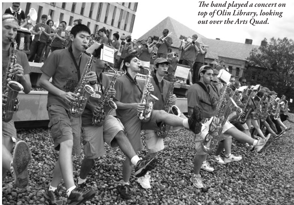
The band played a concert on top of Olin Library, looking out over the Arts Quad.