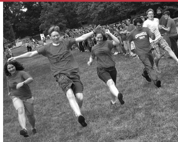
Freshmen as they practice "strutting" on the Arts Quad during band camp.