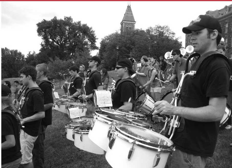
The drumline rocks out at a concert on Libe slope.