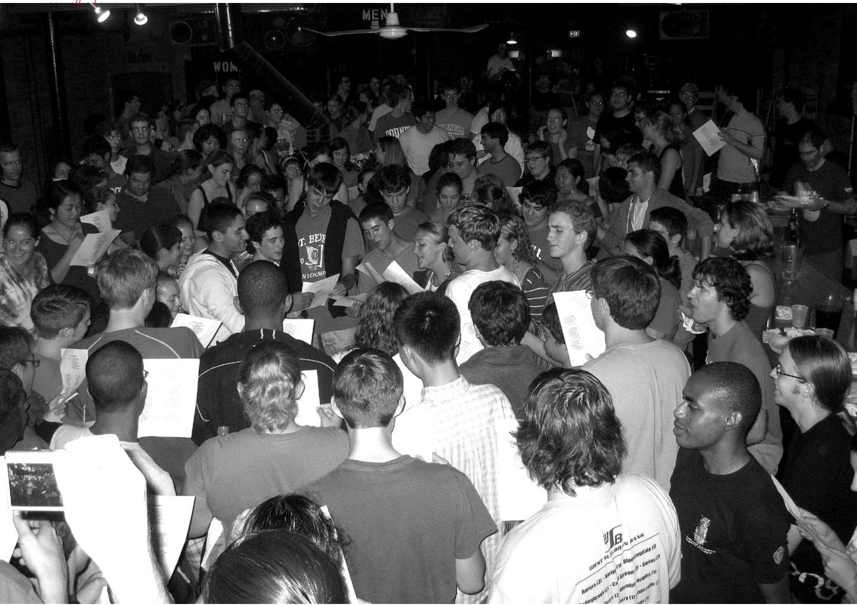
Freshmen sing traditional songs at the Nines after the first rehearsal of the year.