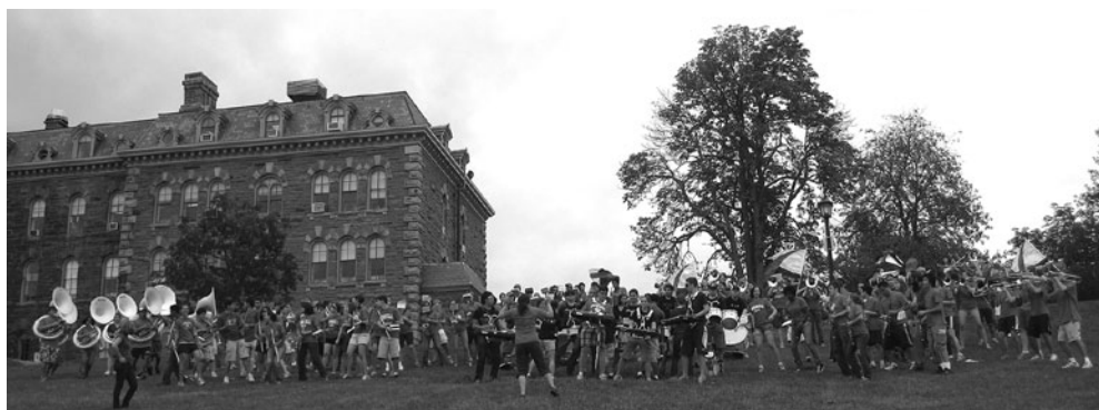
The band plays a concert on Libe Slope.

Join us on Saturday, November 13 as the Big Red Band once again marches down Fifth Avenue to the Cornell Club for the Sy Katz '31 Parade!