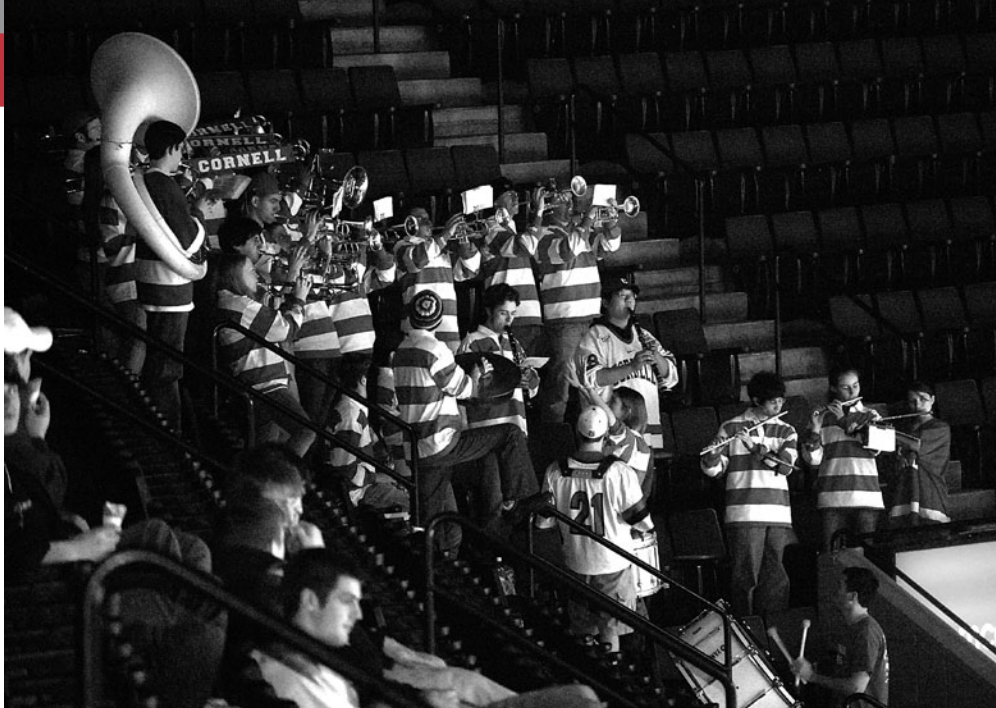
The band played at the men's ice hockey NCAA tournament in Grand Rapids, Mich.

For more information: www.cornellbigred.com/schedule.aspx?path=mbball&