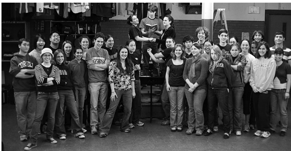
Presenting the only REAL Band Staff of the only REAL Marching Band in the Ivy League!