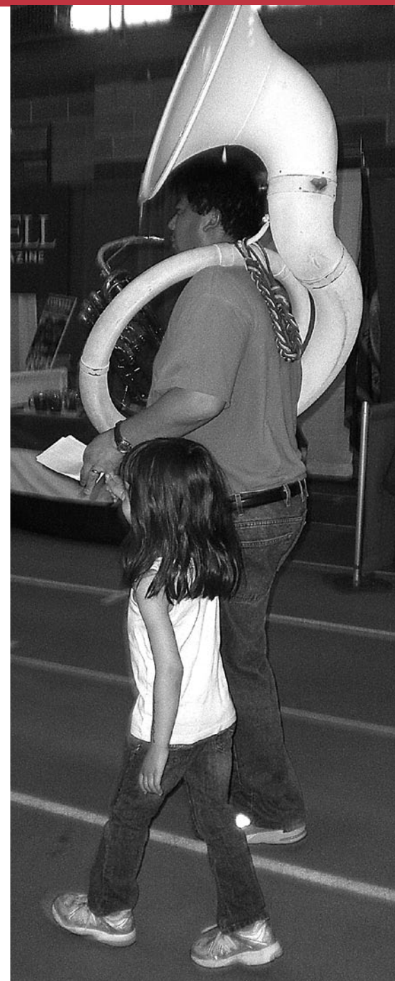
The tuba might be too big for her now, but she'll grow into it.