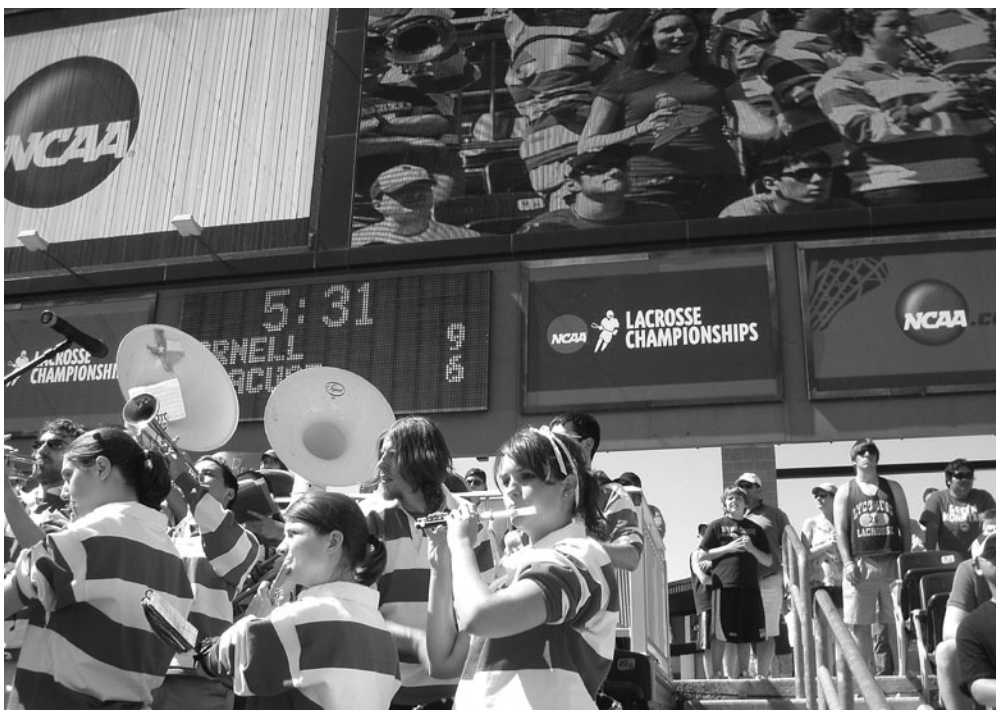
The band makes it on the big screen at the NCAA Men's Lacrosse Championship game.