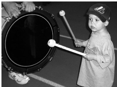
The youngest member in Big Red Band history?

Whether you attended Reunion or not, we hope that you can join us for Homecoming this year on October 26! Hot Truck may not be so conveniently located during Homecoming, but we guarantee that you'll get a chance to play and parade just like you used to in the Big Red Band.