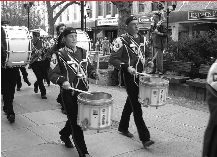
The drumline rocks Ithaca Commons during the Spring Concert.