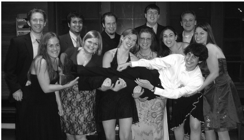
The Big Red Band's newest alumni: class of 2009.