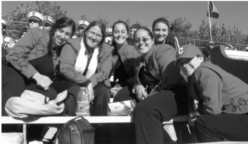
Twirlers and color guard members relax on a sunny day.

although they were small in number (there were only 18 members there), we still had a great time with them. We have also started performing joint post-game concerts with some of the other bands. It started when we went to Brown and then asked them if they would join us afterwards. We had a fun time, so we invited the bands of Princeton, Dartmouth, and Penn perform with us when they came to visit. It was great to spend time with other bands and get to know them a bit better, and we’re hoping that this can continue in the future.