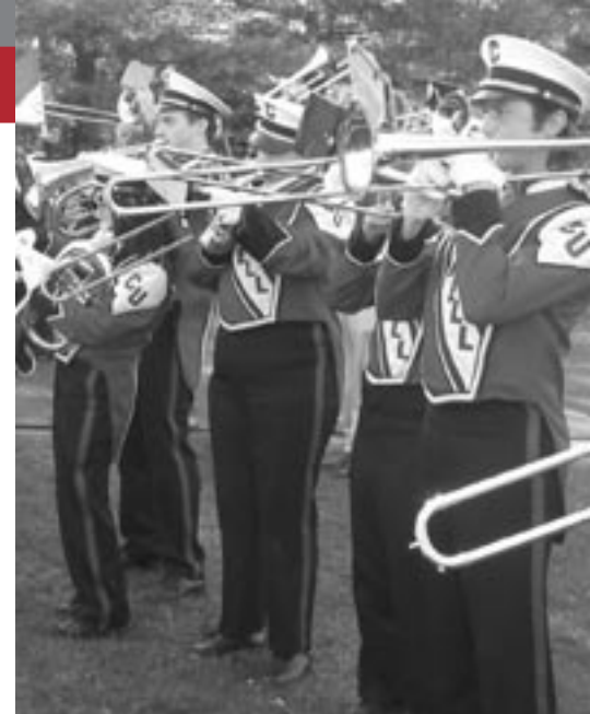
Big Red and Brown trombones mix during a combined concert with Brown's band.