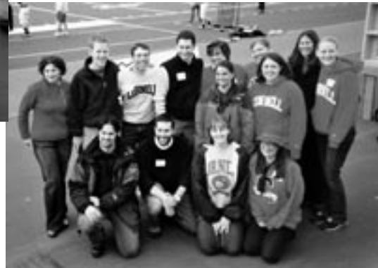
...they were outnumbered by the 14 head managers who showed up.