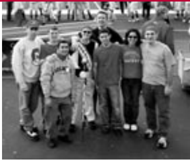
Nine drum majors showed up for Homecoming, but...